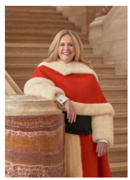
Justice Sheilah Martin

Justice Martin's reasons for judgment provide judges and lawyers with welcome guidance for grappling with child welfare cases and, additionally, specifically address the legal questions of (1) when can an appellate court intervene in determining the best interests of a child in custody matters — in this case, the standard of review for disposition decisions pursuant to child protection legislation and its application; and (2) what, if any, weight does the "natural or biological parent factor" carry in deciding a child's best interests in a custody/child welfare matter.